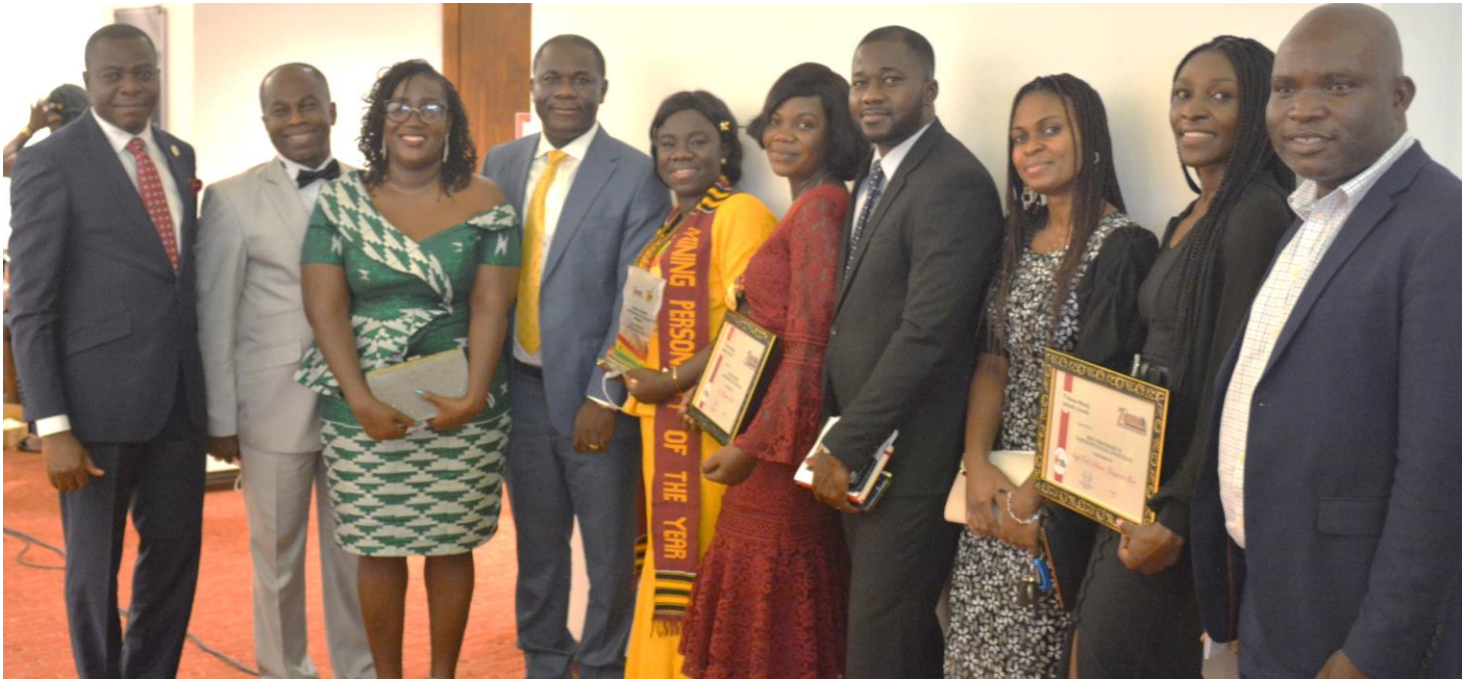
Group photo of AGA team at 7 th Ghana Mining Industry Awards